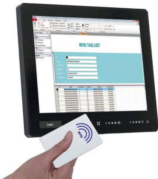
Spectra-Panel Silent-WDL with integrated RFID reader

Spectra supports the implementation of RFID projects. Here are two examples of possible RFID solutions with internal or external RFID readers.