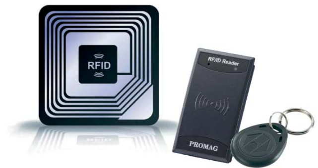
Components for an external RFID reader solution